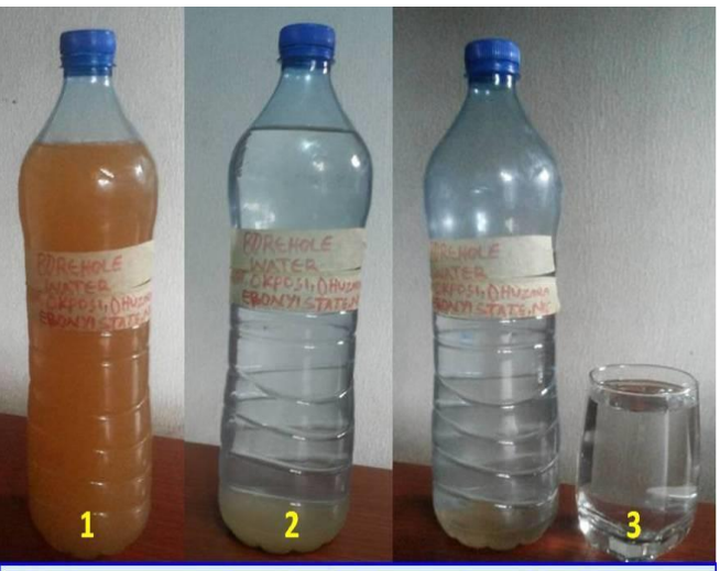
SaferEx treatment of raw borehole water from Okposi Town, Ohaozara L.G.A, Ebonyi State, Nigeria (In situ treatment).