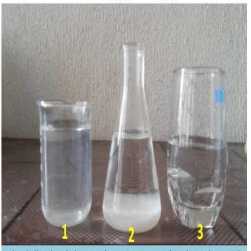
Salty shallow borehole water from Port Harcourt (South-South Nigeria).