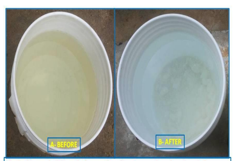
Typical household borehole unsafe salt water analyzed and contains pathogens, metals and salts.